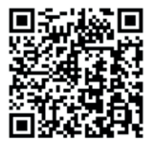
Listen to the capsules

This is how Tendre l'oreille [Tune in] came into being, a small mobile sound exhibition that accompanies the show. A listening station with headphones is accessible in the theatre lobby before and after each performance. Each "capsule" contains a song and an outline of the narrative that explains how it reached us. Audience members can therefore choose to listen again to our encounters with the amateur-participants they have just seen on stage, or discover others. A QR code printed on a card also allows the "capsules" to be taken home where each person can tune in to these other songs, languages and stories.